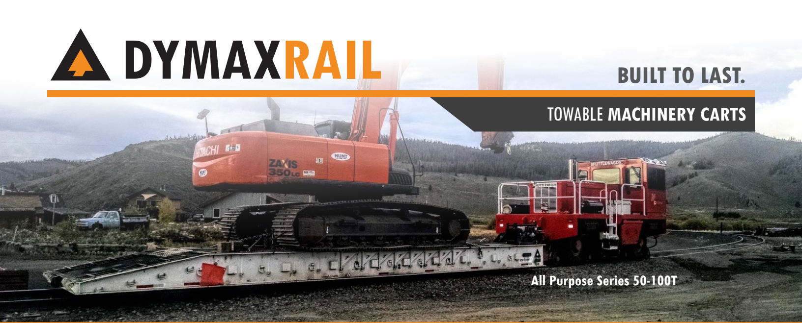
All Purpose Series 50-100T