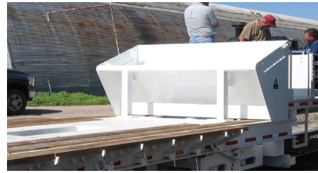
An optional ballast-spreading hopper box adapts to Lo-Railers, allowing standard dump trucks to efficiently unload and distribute ballast.