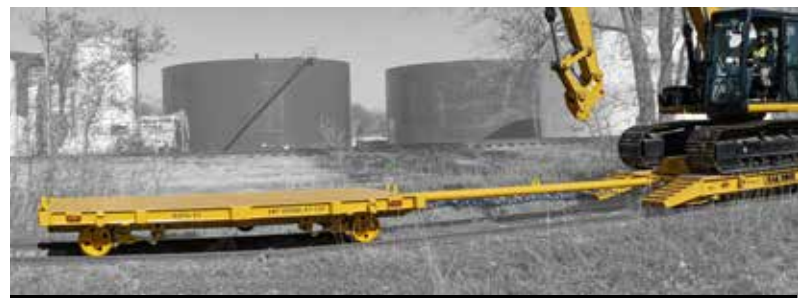
OPTIONAL PULL CARTS AVAILABLE