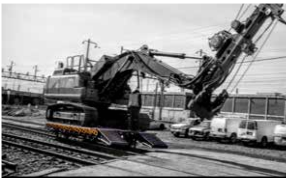
DRILLING AND SHEET PILING