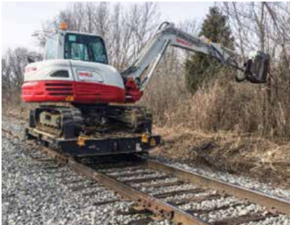
CUT BRUSH AND TREES