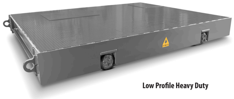
Low Profile Heavy Duty