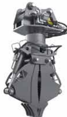
CRIBBING CLAM BUCKET