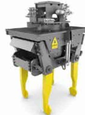
BALLAST TAMPER SERIES 14