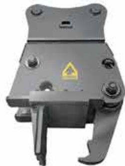
TIE CRANE SLIDE GRAPPLE