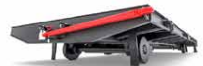
TRACK MAINTENANCE CARTS