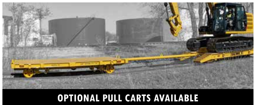
OPTIONAL PULL CARTS AVAILABLE