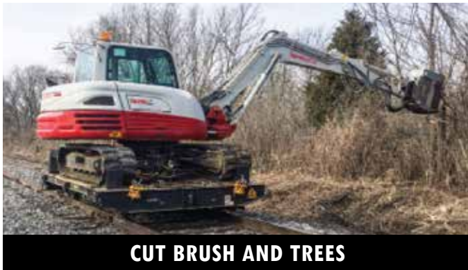
CUT BRUSH AND TREES