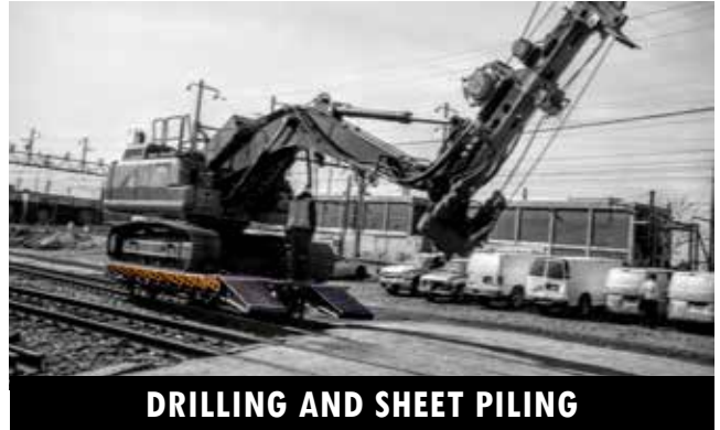
DRILLING AND SHEET PILING