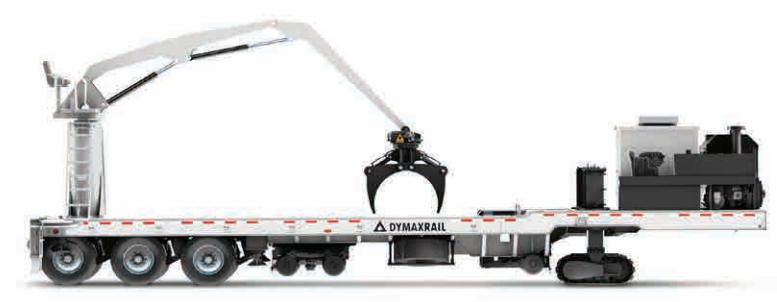
MATERIAL HANDLER - DX-TR-RTX-48S-DMX-50TC