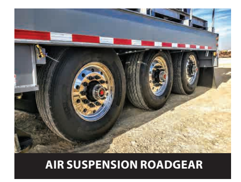
Specialized air suspension with additional lift to provide added clearance on rail. S48 and S53 available with super singles, aluminum rims or can be equipped with traditional duals.

Standard hydrostatic single drive axle featuring a rear oscillation bogie to provide ease of access to and from the rails. Upgrades available including twin or tri-axle drive systems.