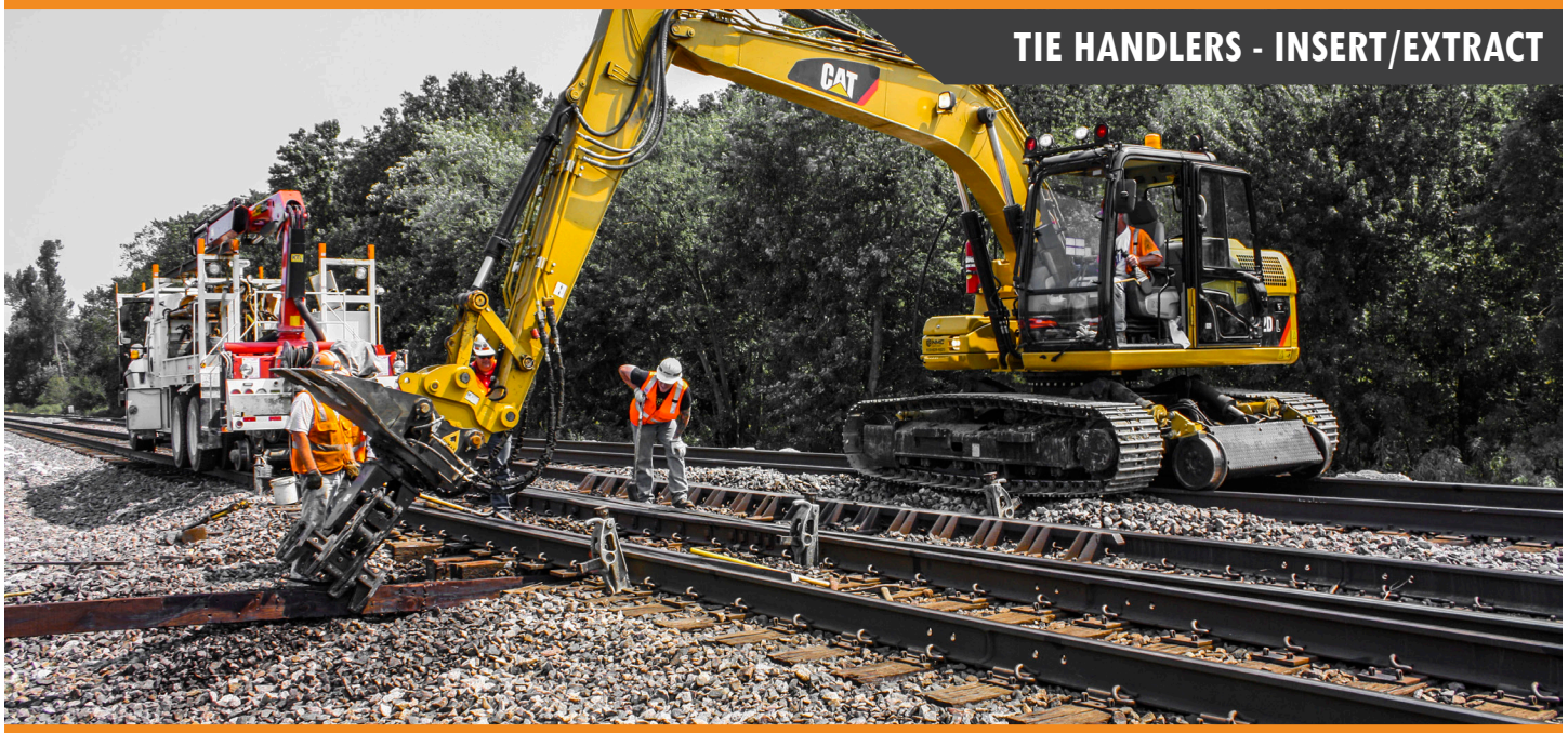
TIE HANDLERS - INSERT/EXTRACT