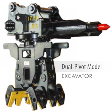
Dual-Pivot Model EXCAVATOR