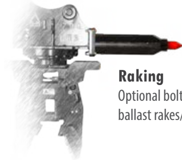
Raking Optional bolt-on ballast rakes/blades.