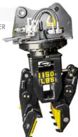
Dual-Pivot Model BACKHOE LOADER